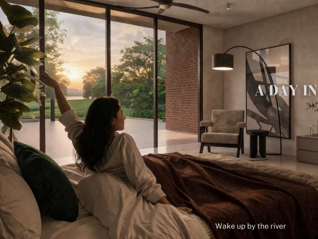
Wake up by the river