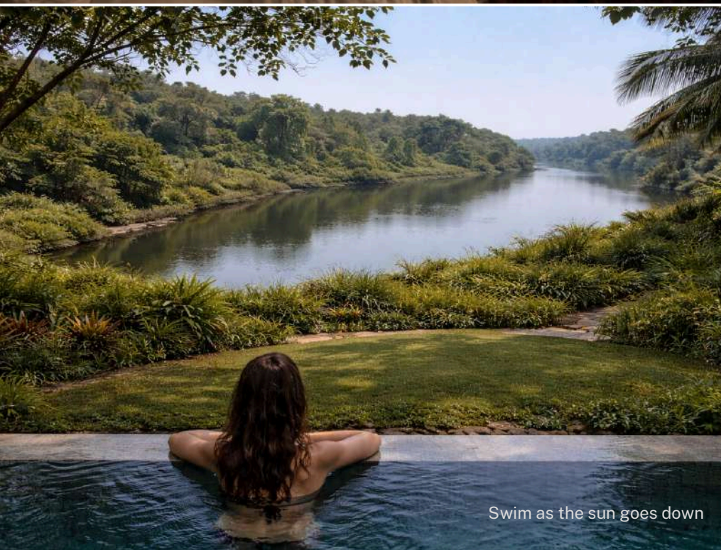
Swim as the sun goes down