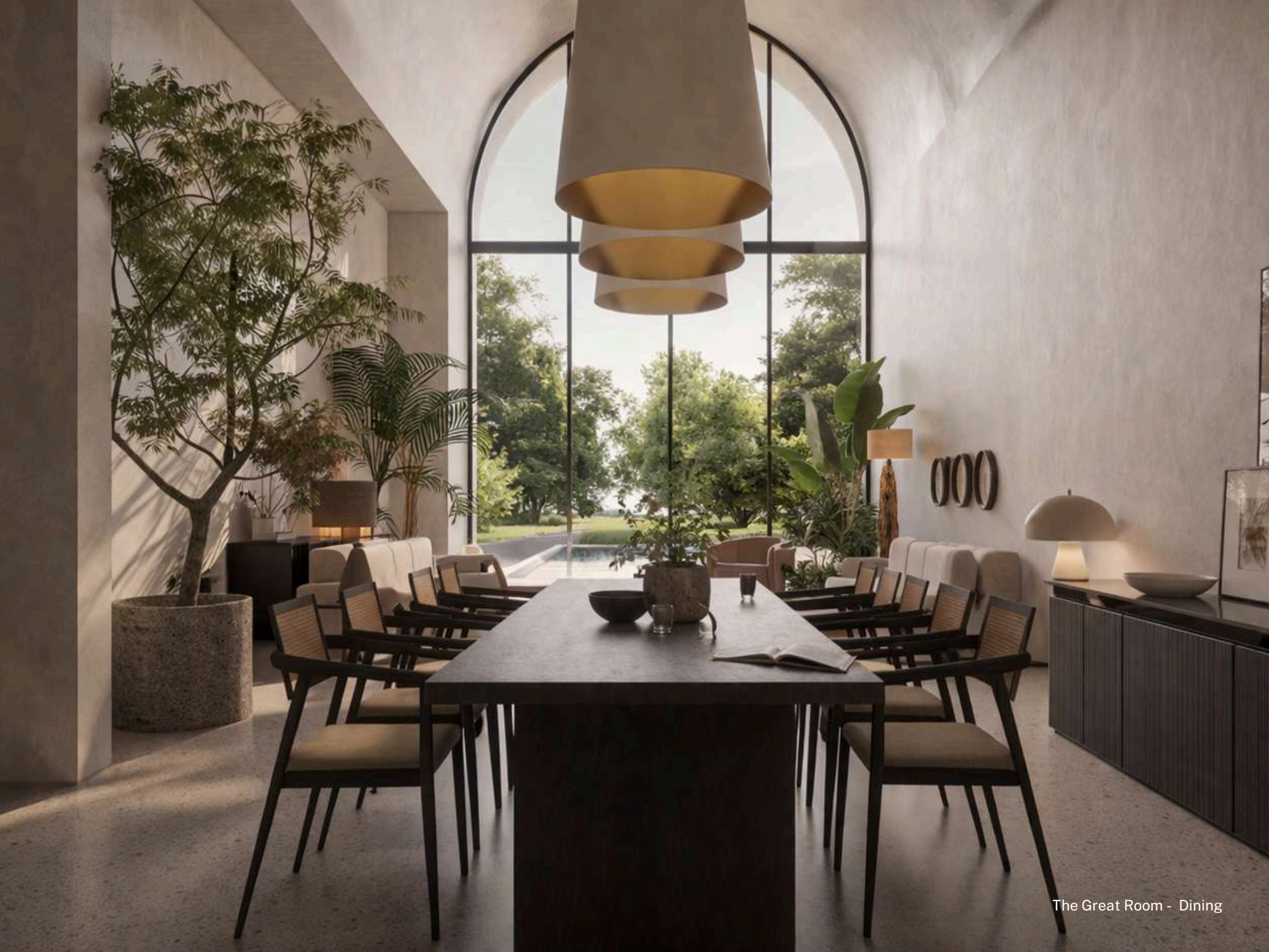
The Great Room - Dining