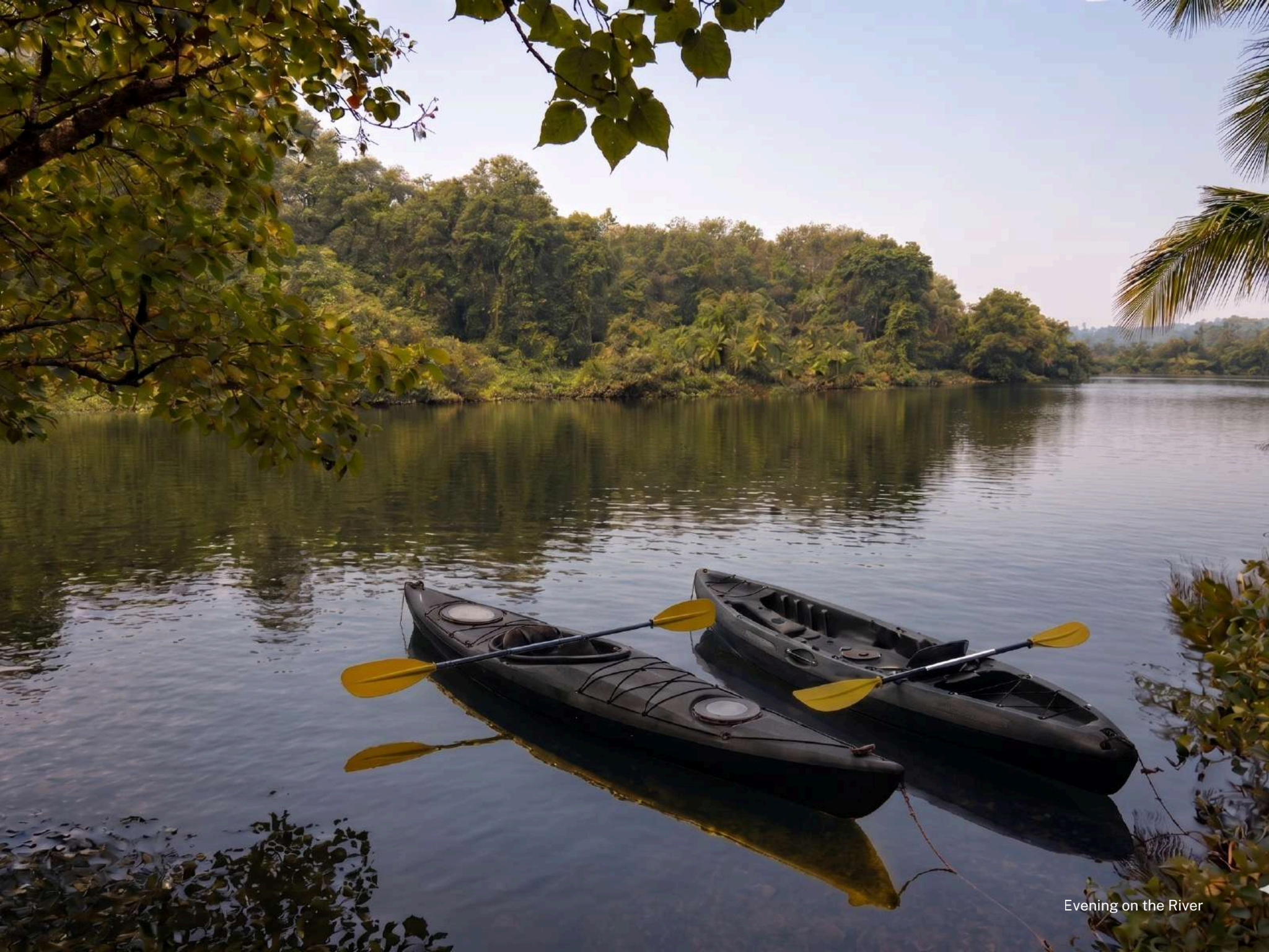
Evening on the River