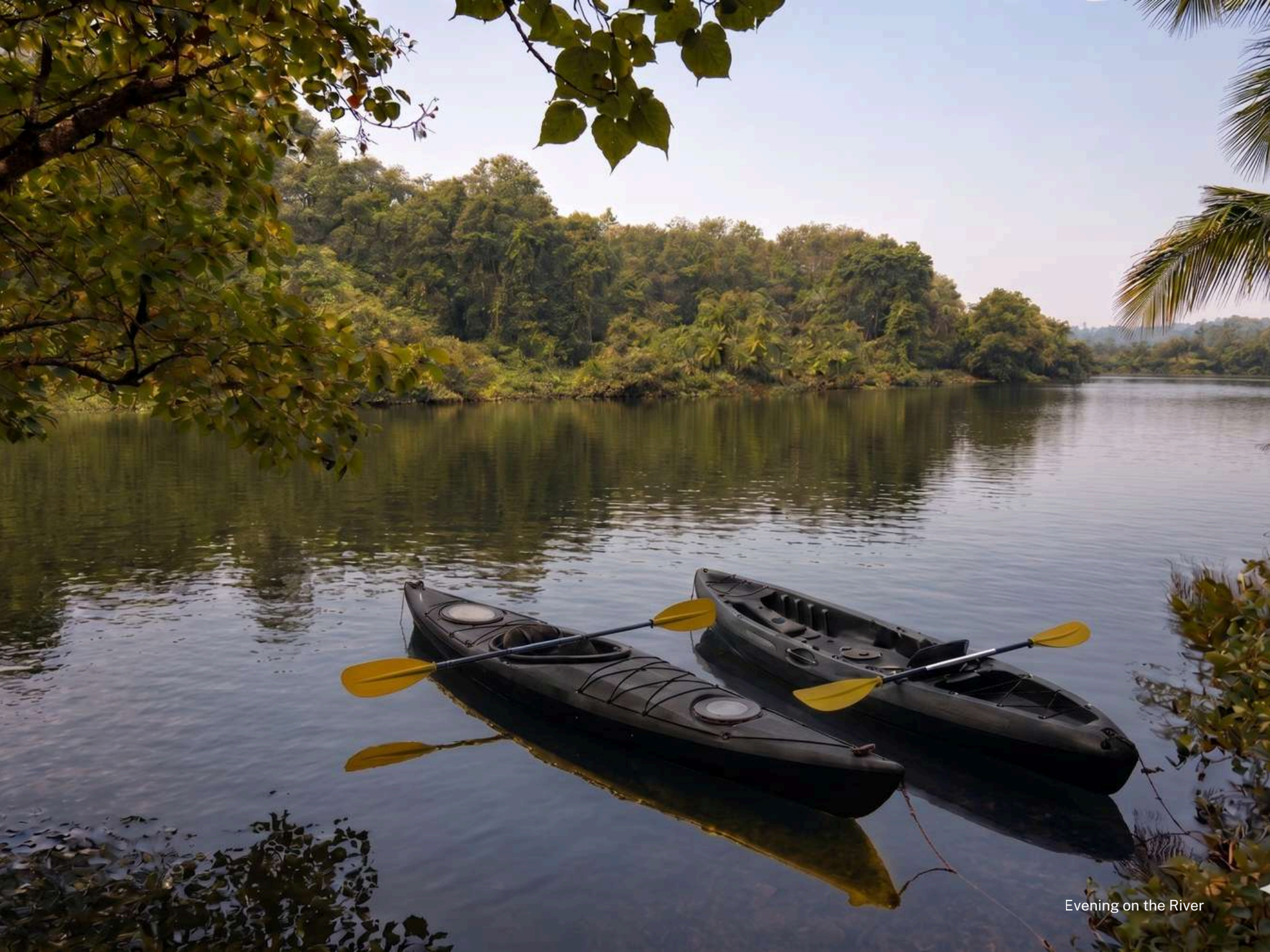
Evening on the River