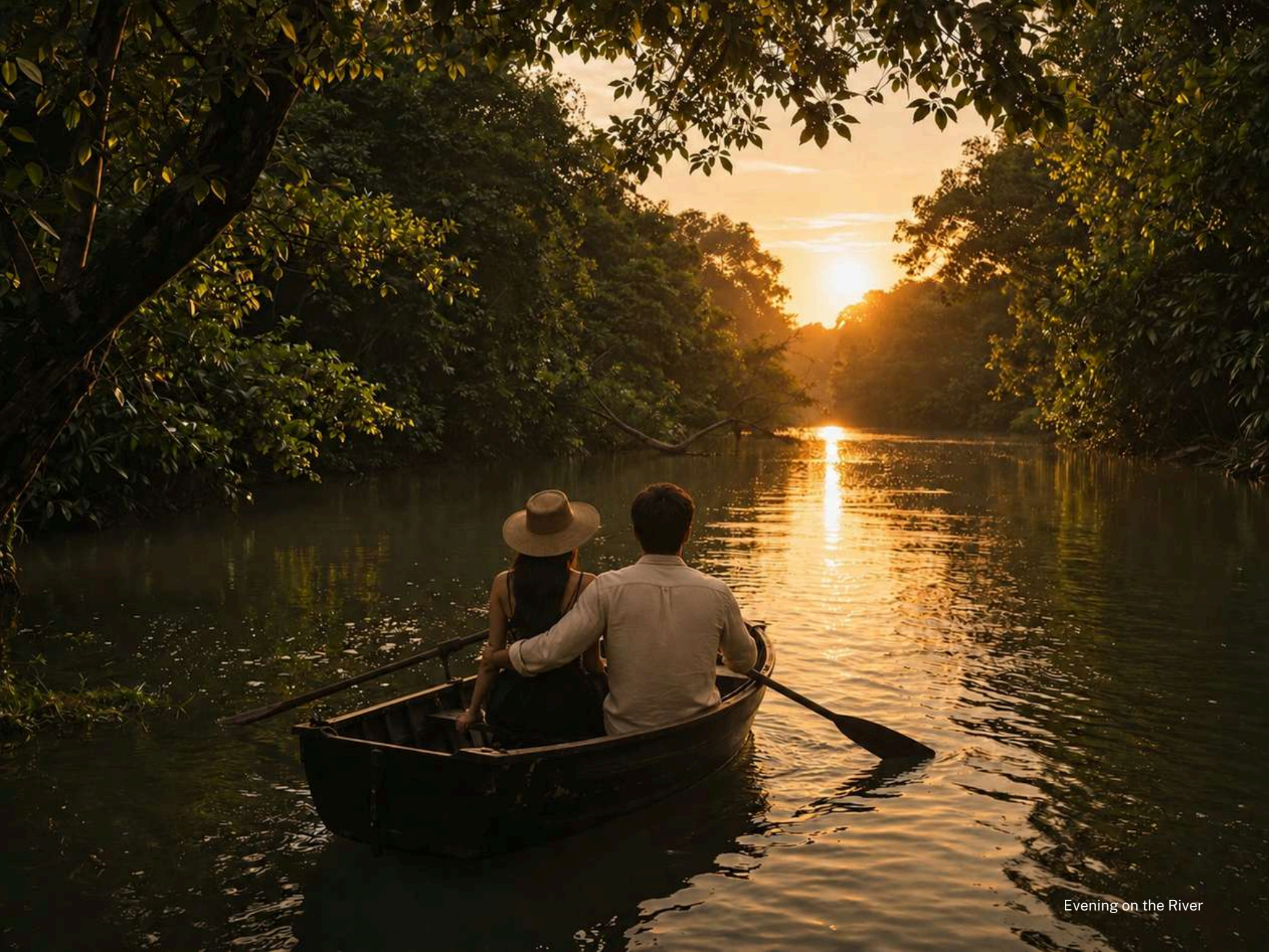
Evening on the River