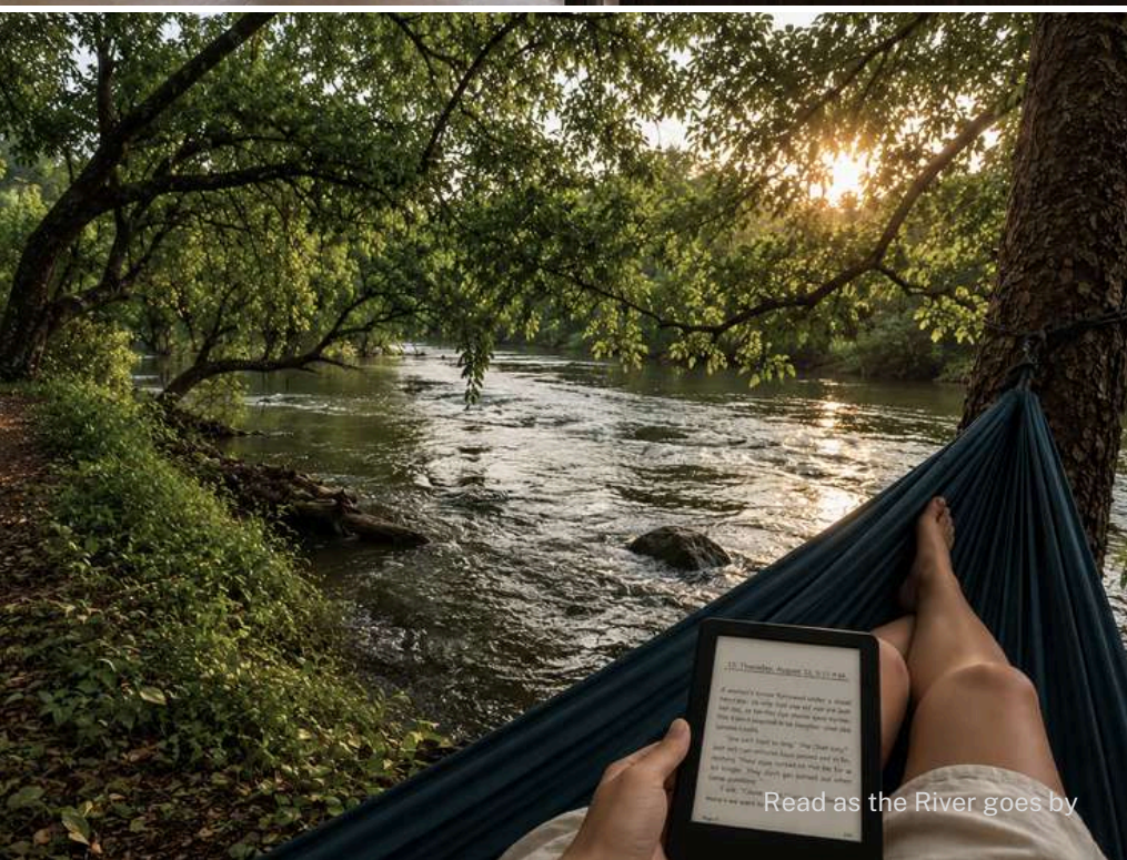
Read as the River goes by