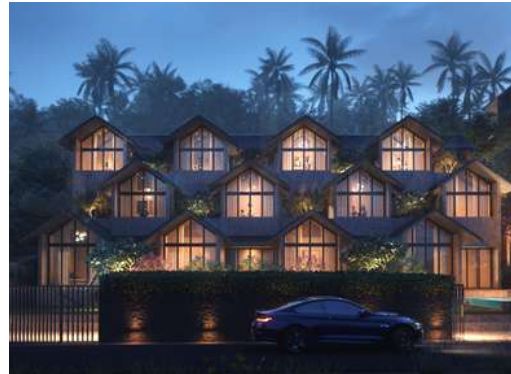
Kasu Sero, Reis Magos 2 Twin homes

Born in Goa , we create places that are intimate in scale, timeless in design, and built to endure .