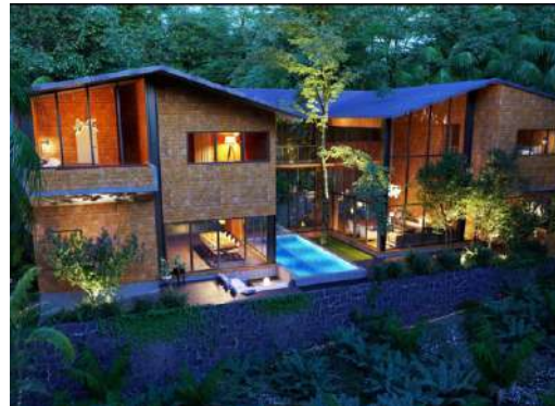
Kasu Vana, Assagao 5 Forest Villas