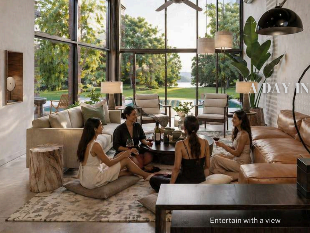
Entertain with a view