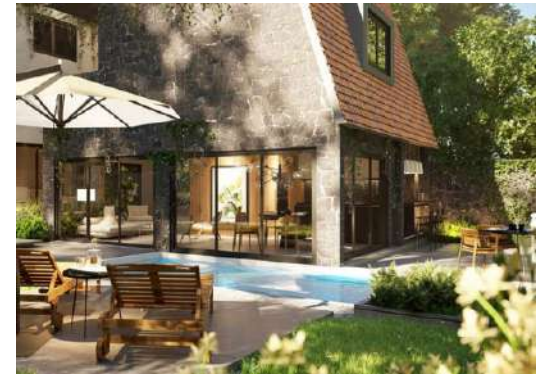
Kasu Zama, Vagator 14 Villas