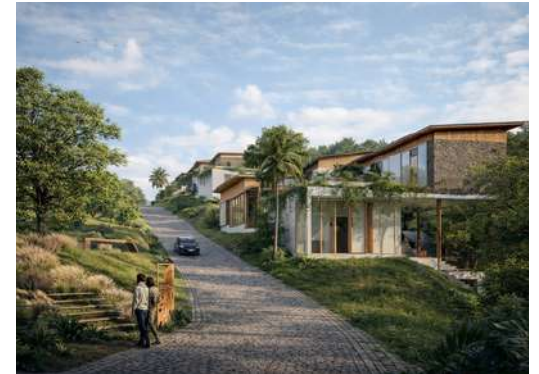
Kasu Ekanta, Tivim 44 Plots + Villas