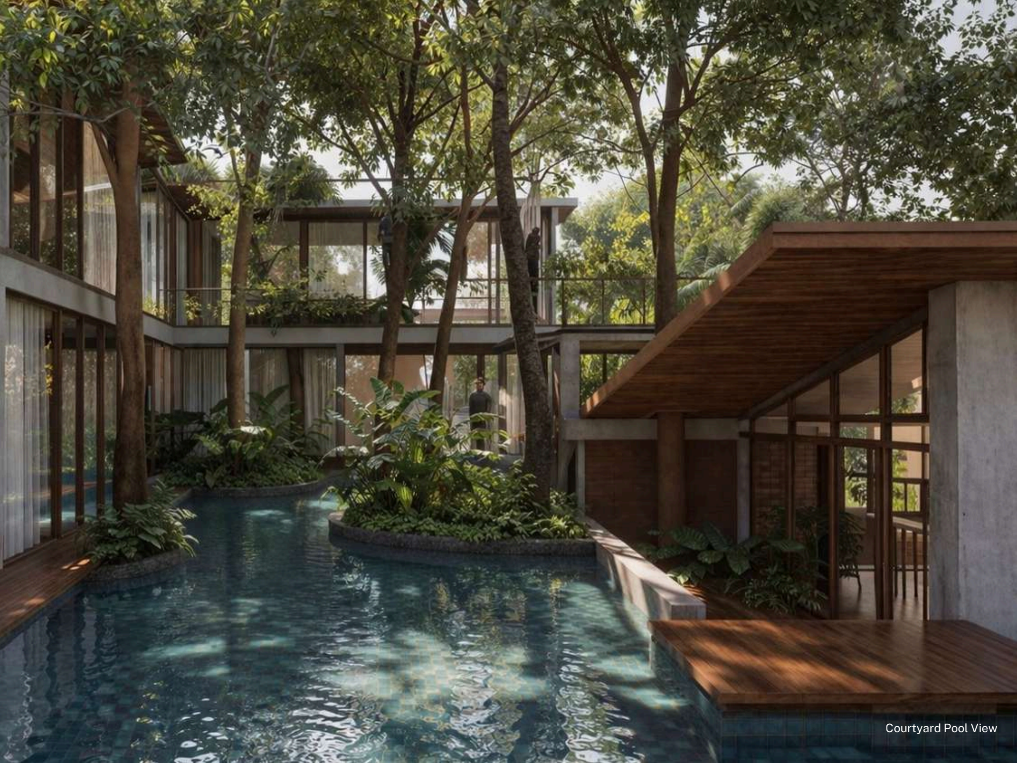
Courtyard Pool View